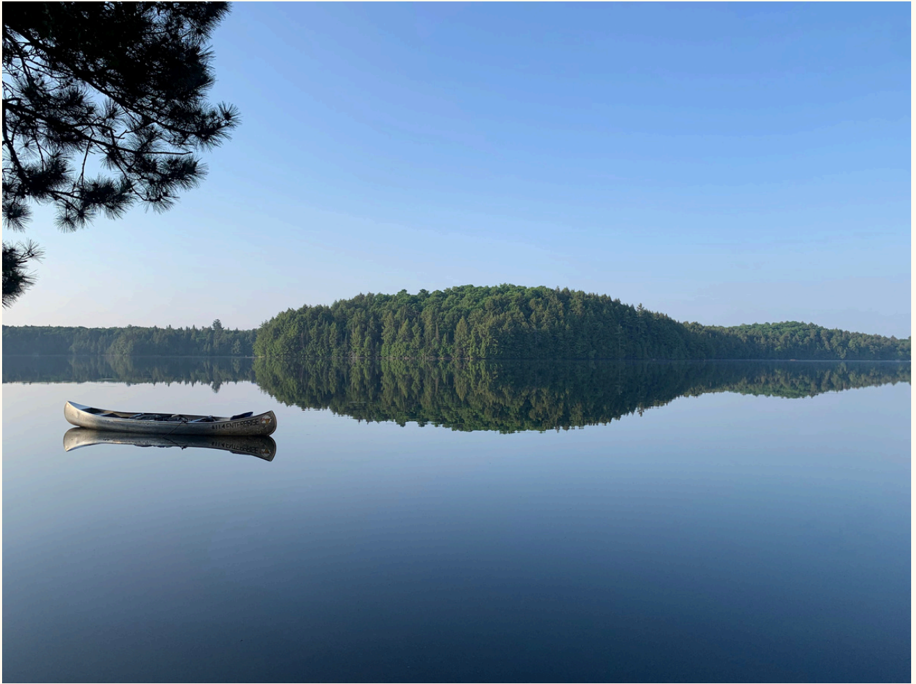
A calm morning