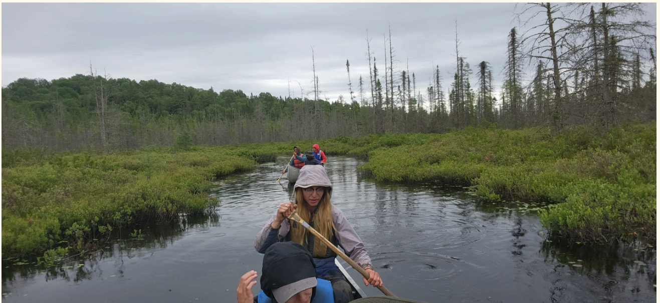
Paddling in the rain