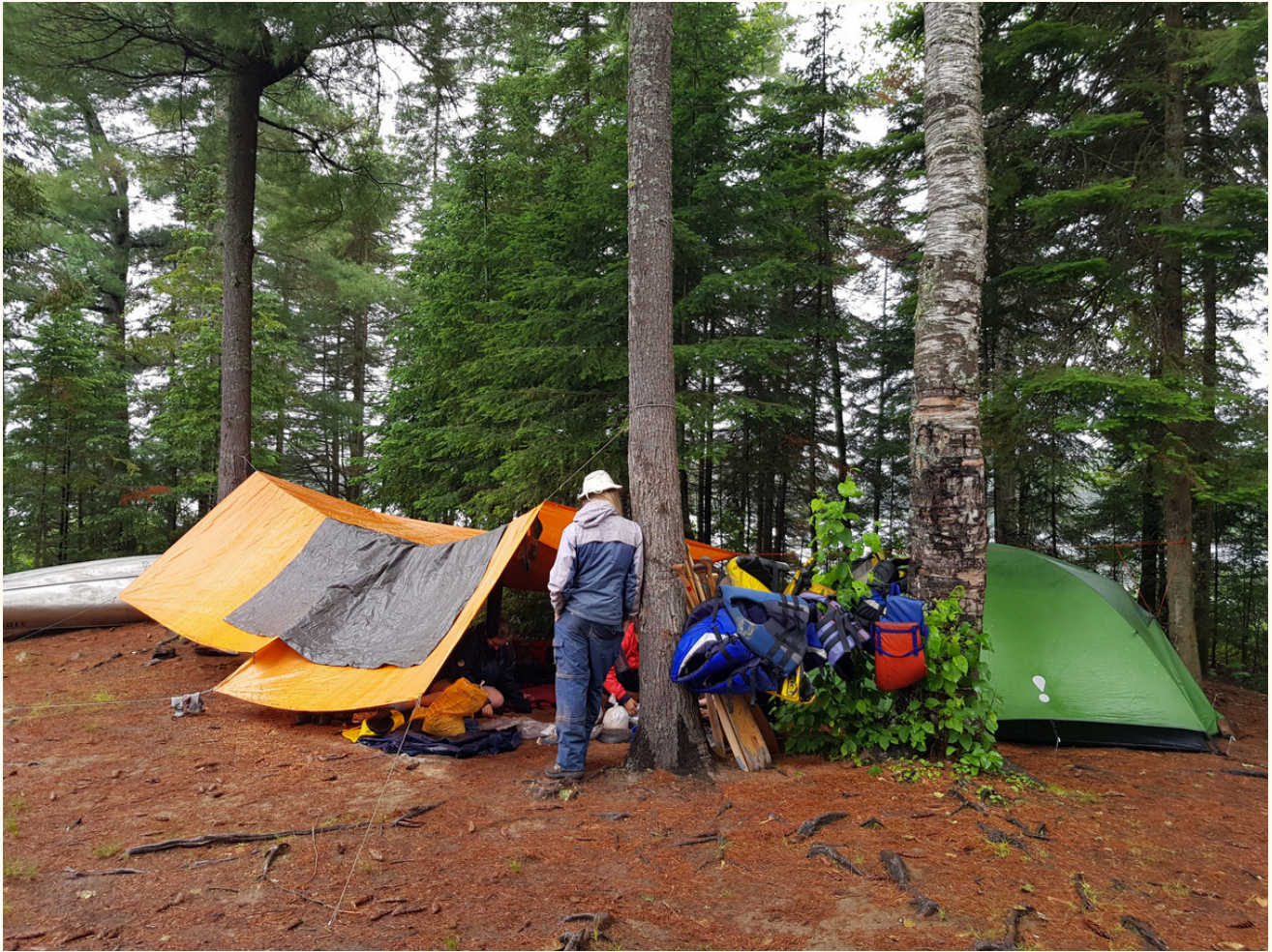
An indestructible tarp setup