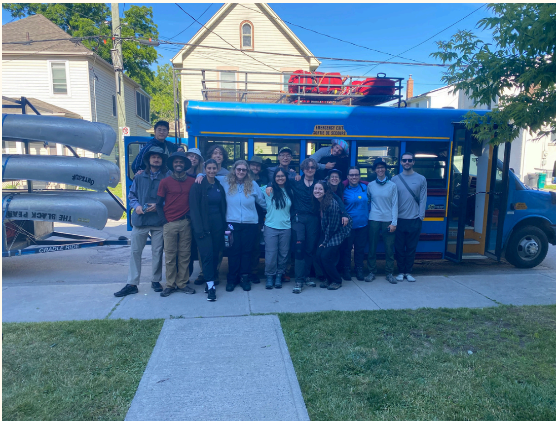
The 2024 summer staff before heading out on staff trip

As Outlook continues to grow and evolve, the Board is always looking to improve and modernize Outlook's policies. We are grateful for the feedback Raven and the other summer staff have provided and continue to provide which we look forward to applying. The practical insights gathered help us to improve and enhance the camp experience for the summers to come.