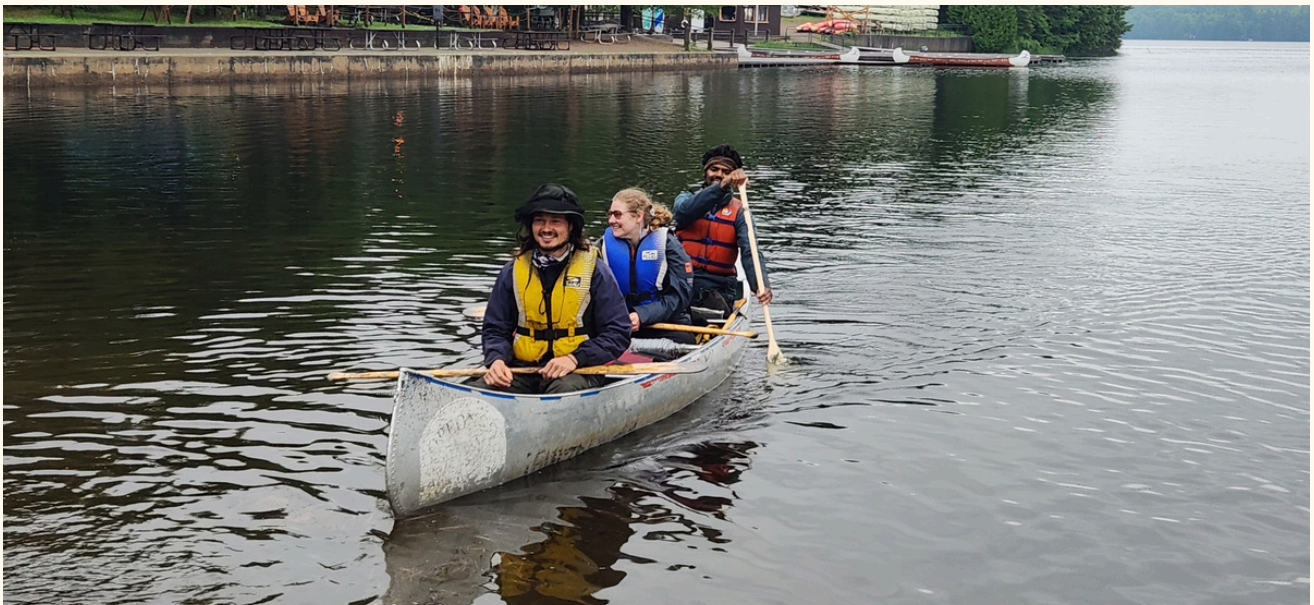
Back at the Canoe Lake access point! Time for icecream?